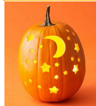
Designer Pumpkins Several designs